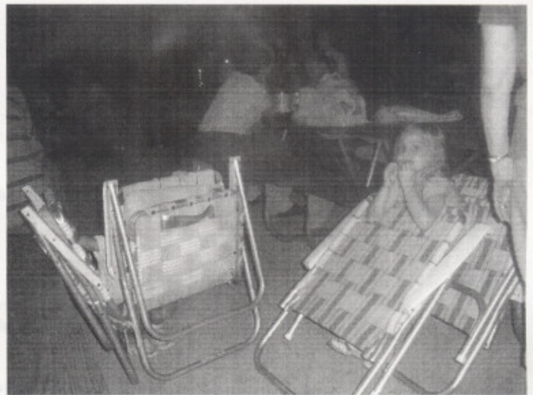
WHY DO I GET STUCK LOOKING AFTER THE CHAIRS