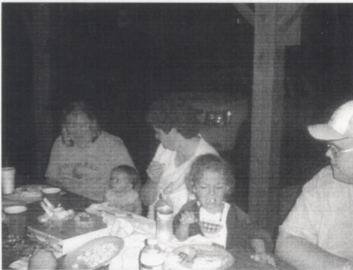
EVERYONE WANTS TO LOOK AFTER THE BABY