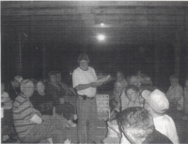
MEETING IN THE RAIN (UNDER THE SHELTER)