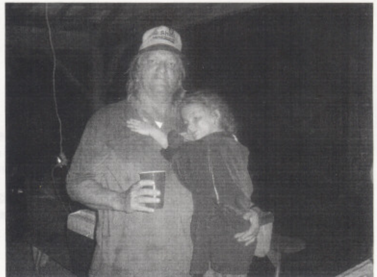
GRANDPA'S ARE LOVEABLE