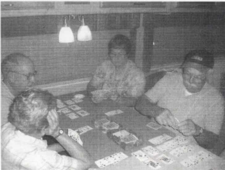
AT LEAST IT IS DRY IN THE CAMPER