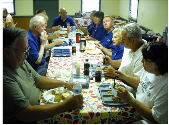
Everyone enjoying the meal