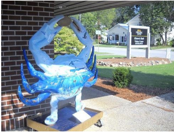
Crab Sculpture – Bath N.C. Visitor Center