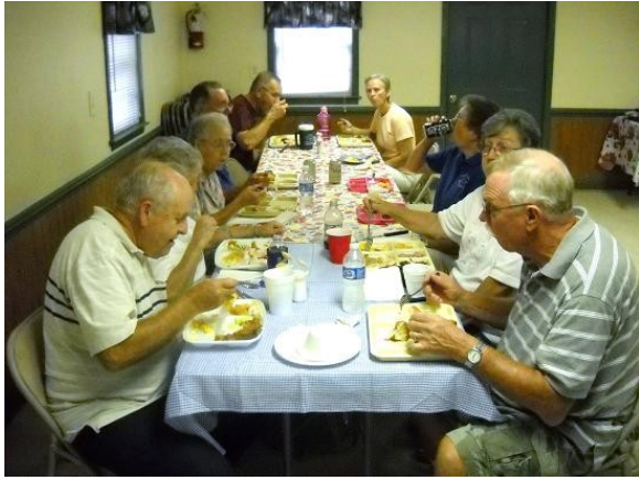
Food & Fellowship