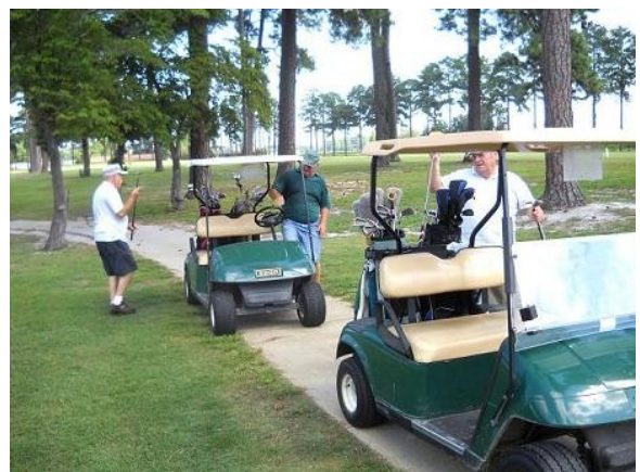
End of a good round of Golf